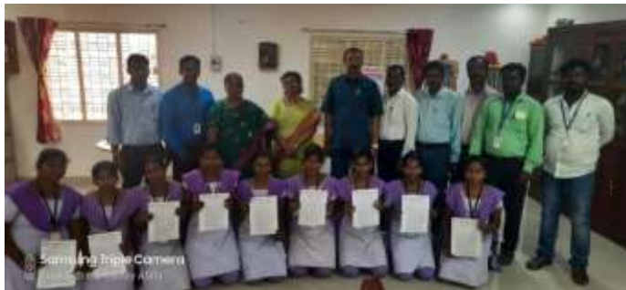
PHOTO 1 SELECTED STUDENTS WITH THEIR APPOINTMENT ORDER (CAREER & GUIDANCE AND PLACEMENT CELL)