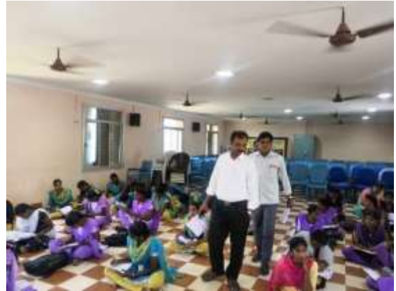
PHOTO 2 PLACEMENT CELL SUPERVISING THE WRITTEN EXAMINATION