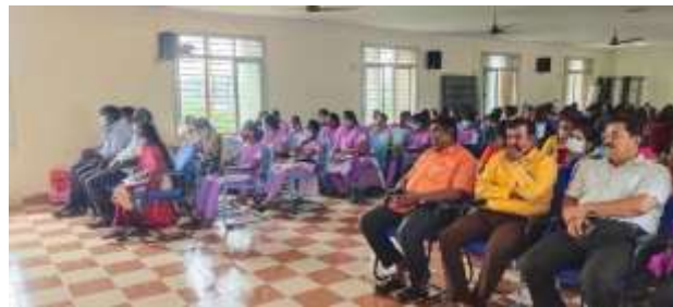
PHOTO 3 PARTICIPANTS ( STUDENTS AND STAFF MEMBERS )