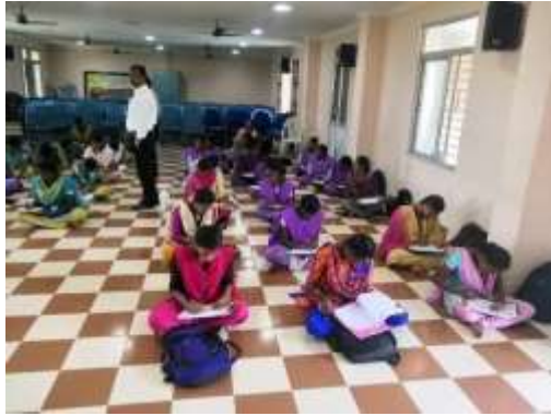
PHOTO 1 STUDENTS APPEARING FOR WRITTEN EXAMINATION