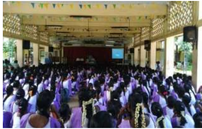
PHOTO 1 PREPARING STUDENTS APPEAR FOR TRAINING AND INTERVIEW (CAREER & GUIDANCE AND PLACEMENT CELL)