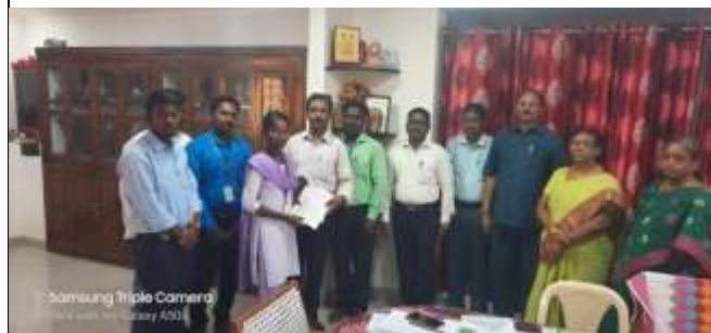
PHOTO 2 DISRIBUTION OF APPOINTMENT ORDER TO THE STUDENTS BY THE CAREER & GUIDANCE AND PLACEMENT CELL IN CHARGES