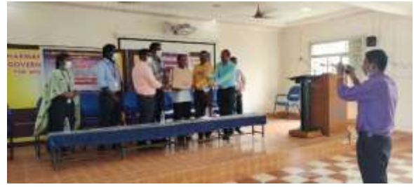
PHOTO 2 WELCOMING THE COMPANY IN CHARGES FOR RECRUITMENT PROGRAM