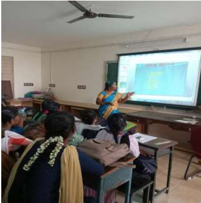
Department of Tamil