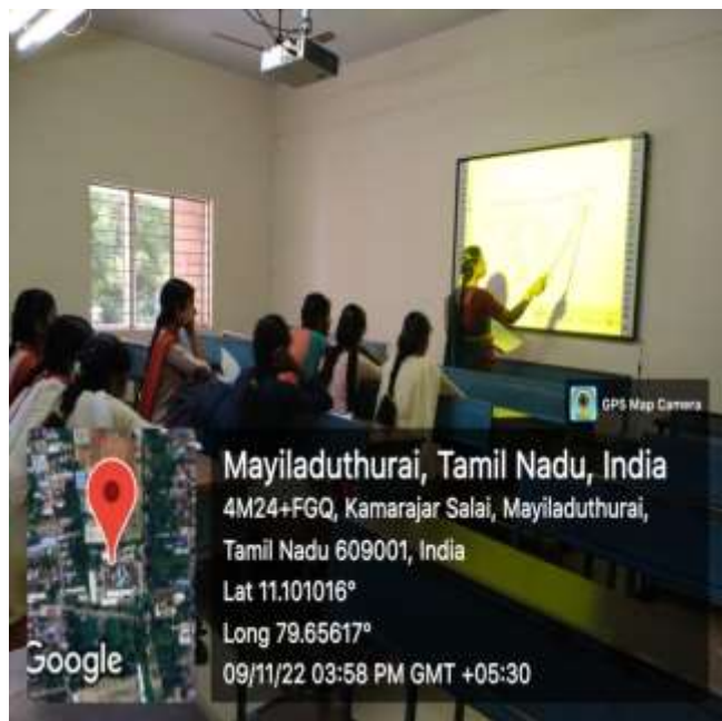
Department of Mathematics