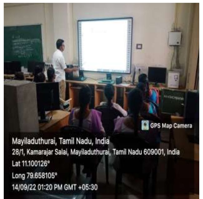
Department of Computer Science