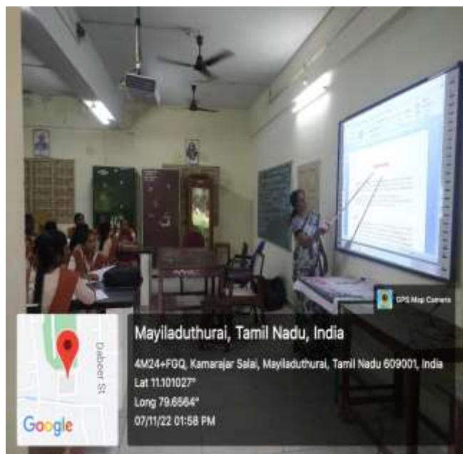
Department of Zoology