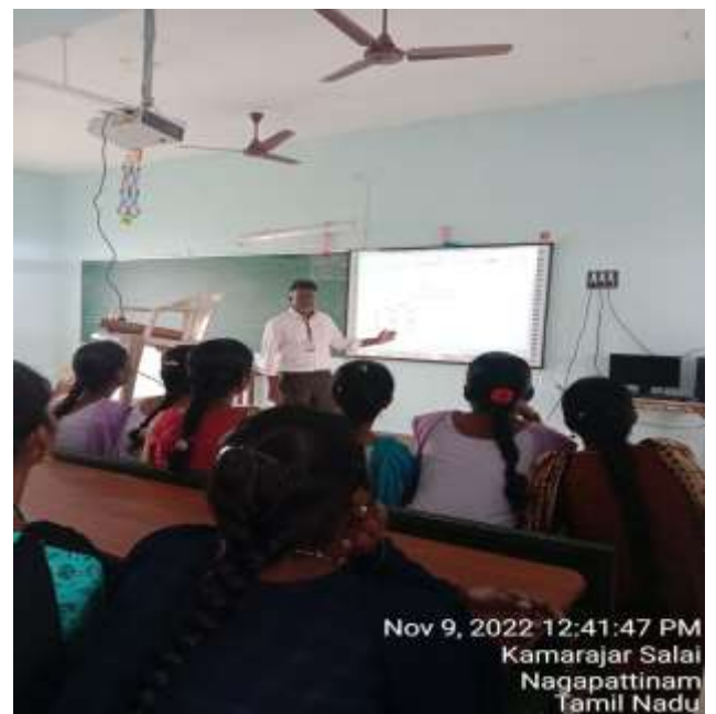
Department of Physics