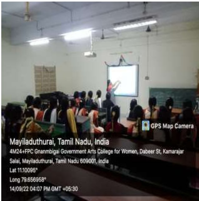
Department of History