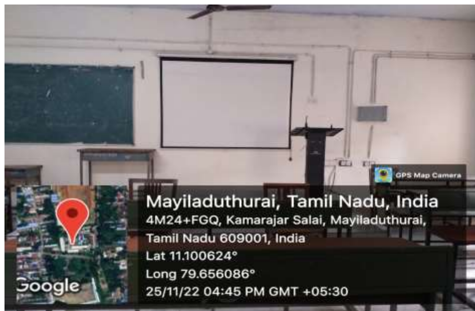
Soft Skill Class Room