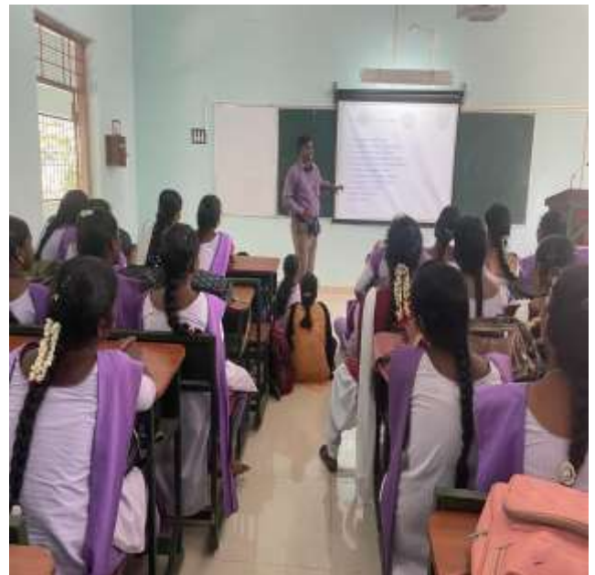
Department of Economics