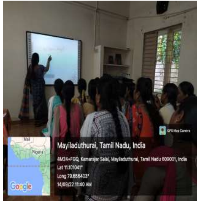
Department of English