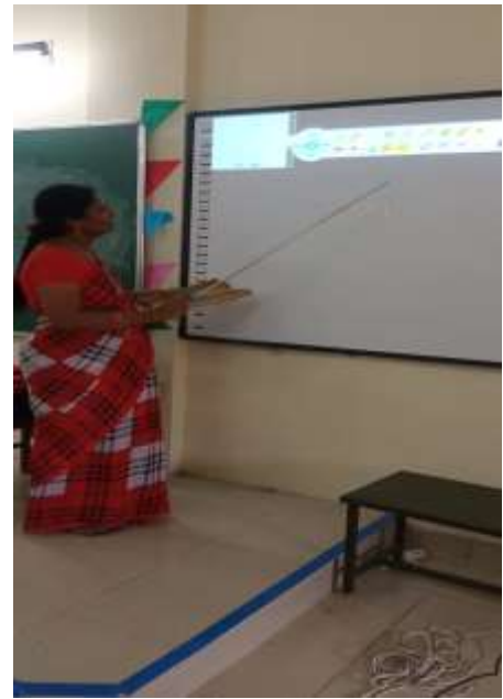
Department of Chemistry