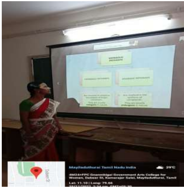
Department of Biochemistry